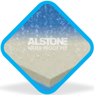
No effect of Termites on ALSTONE Water Proof Ply