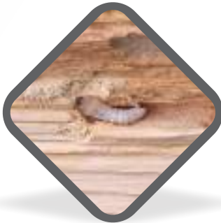
Effect of Termite (after some years) on Treated Plywood available in market

101% Termite and Borer Proof Ply. No entry for Termites, Borer and Moisture Inside