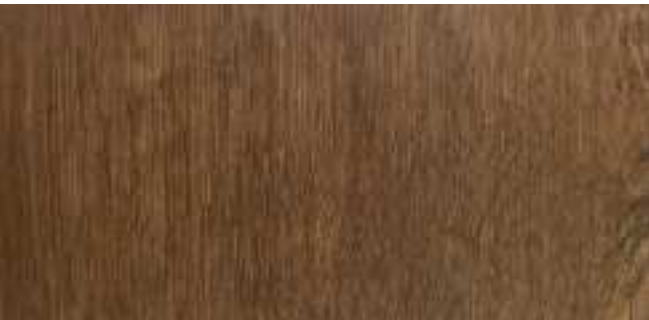
Code : FX502 Smoked Teak