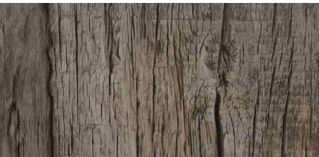
Code : FX506 Taupe Tropical