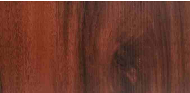
Code : FX504 Mahogany