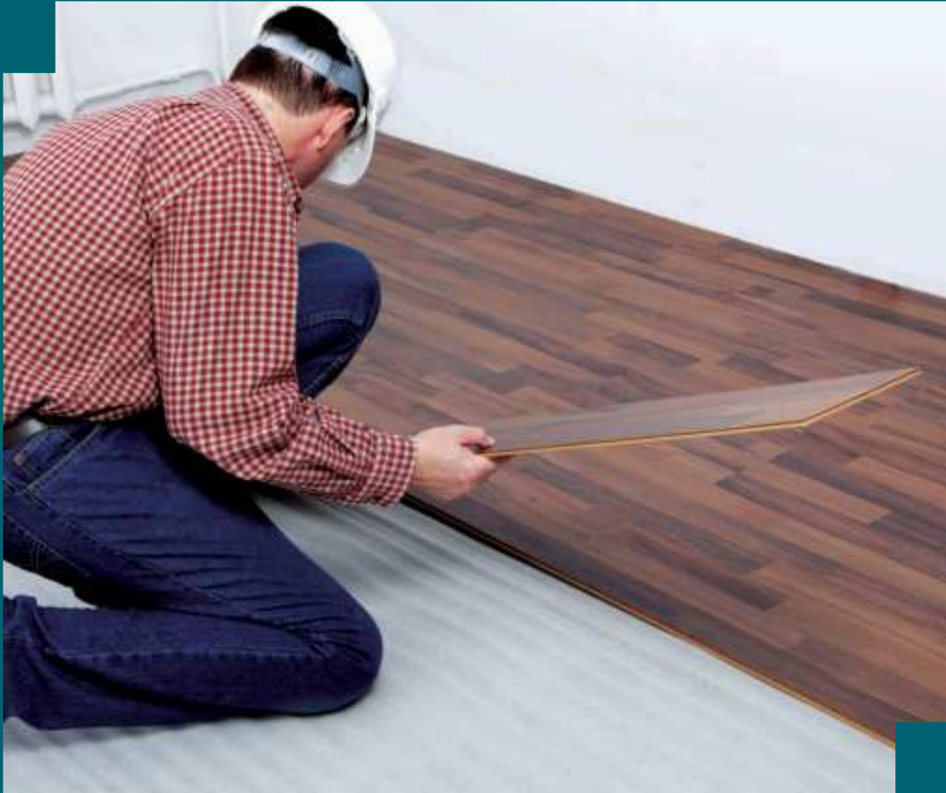
Flooring Locking Systems