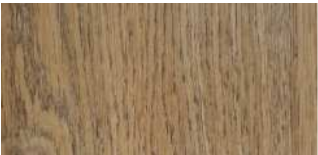
Code : FX505 Cyprus Cedar