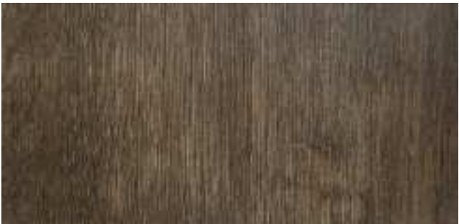
Code :FX501 Travish Oak Smoked