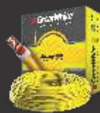
Wires & Cables