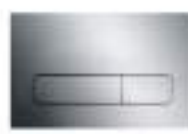
Luxe - M03 Article No : 588.73.542