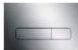
Luxe - P03 Article No : 588.73.582