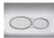
Luxe - M02 Article No : 588.73.523