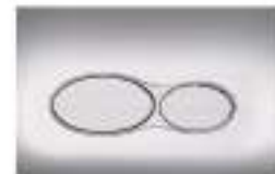
Luxe - P02 Article No : 588.73.563