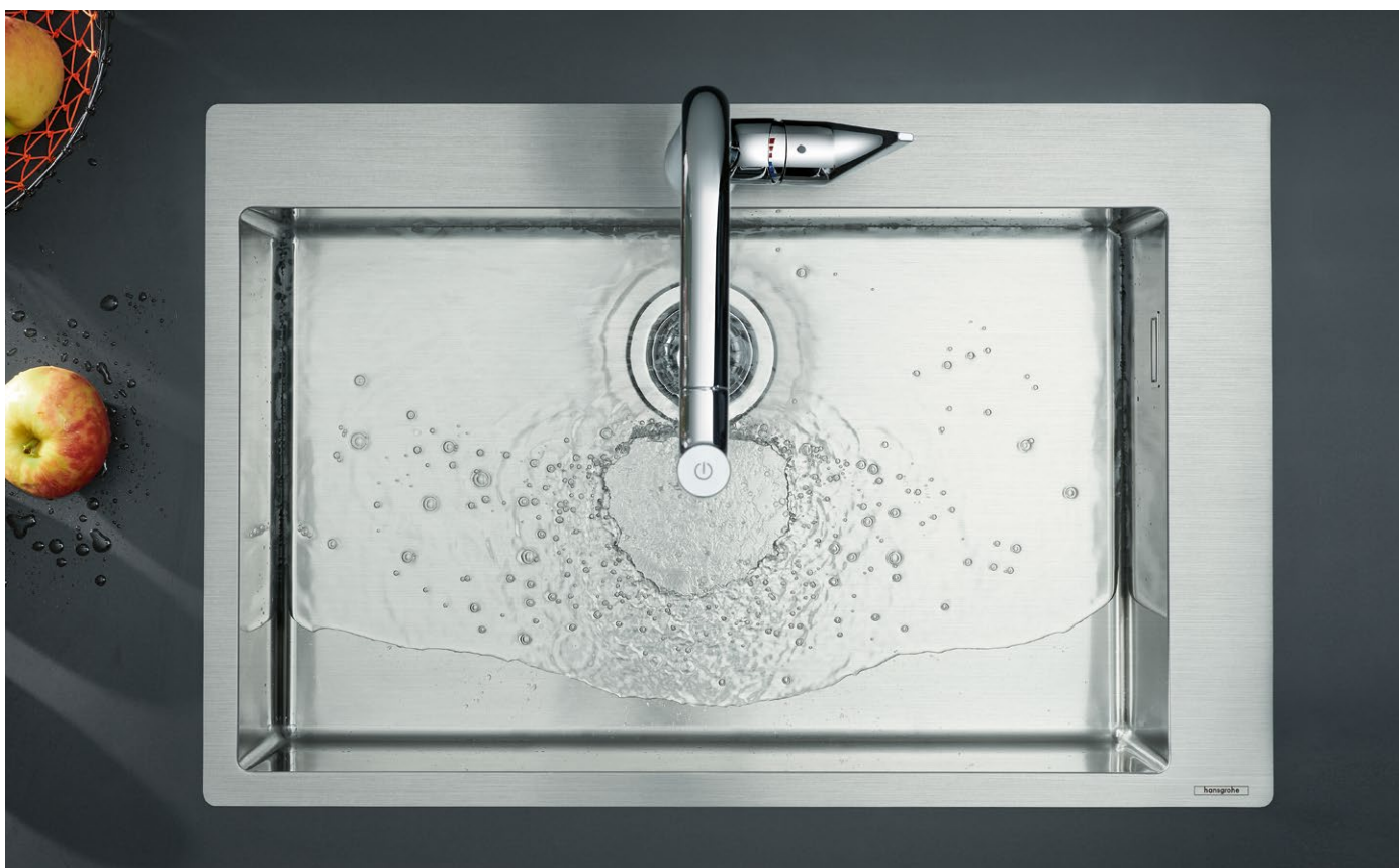
Single bowl: Suitable for base units from 80 cm with a bowl width of approx. 66 cm and for base units from 60 cm with a bowl width of approx. 45 cm (not shown).

The sink is attached to the worktop from below. This makes the kitchen more spacious.