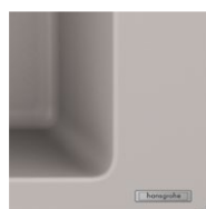
concrete grey -380