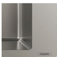
stainless steel -800

is available in three colours, allowing colour accents to be added to the kitchen design.