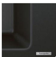
graphite black -170